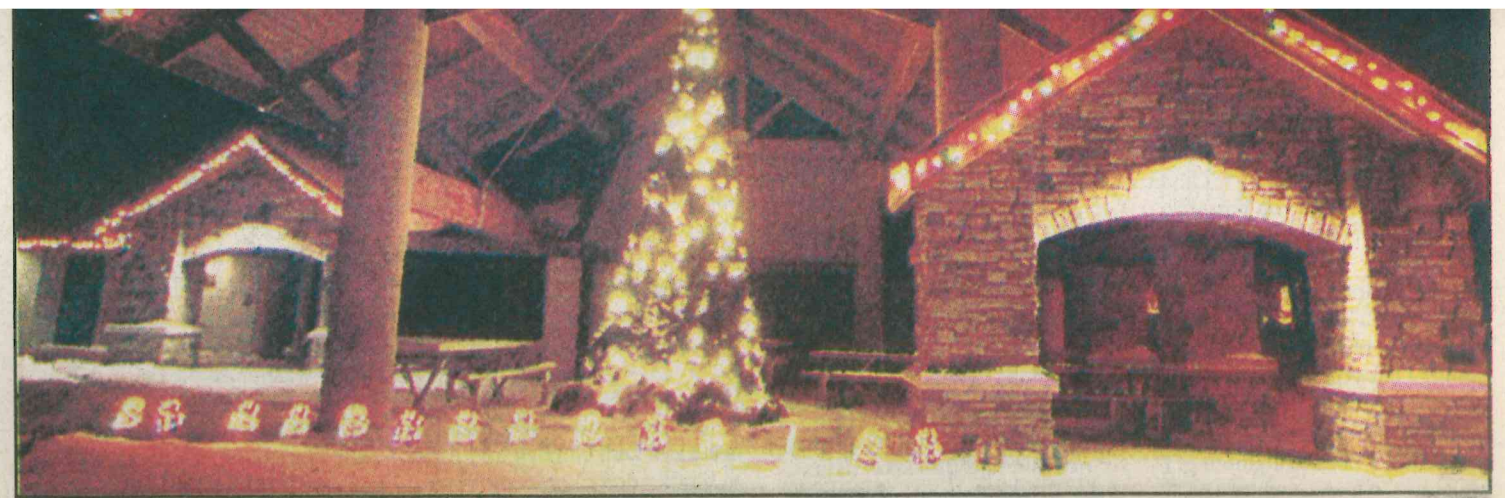
The Village Park Shelter has also been decorated and adorned with lights this year.